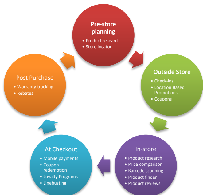
Exhibit 1: Retail Touch Points

As Exhibit 1 shows, there are five key touch points to consider when developing a mobile + in-store retail strategy: pre-store planning, outside store experiences, in-store experiences, checkout, and post purchase.